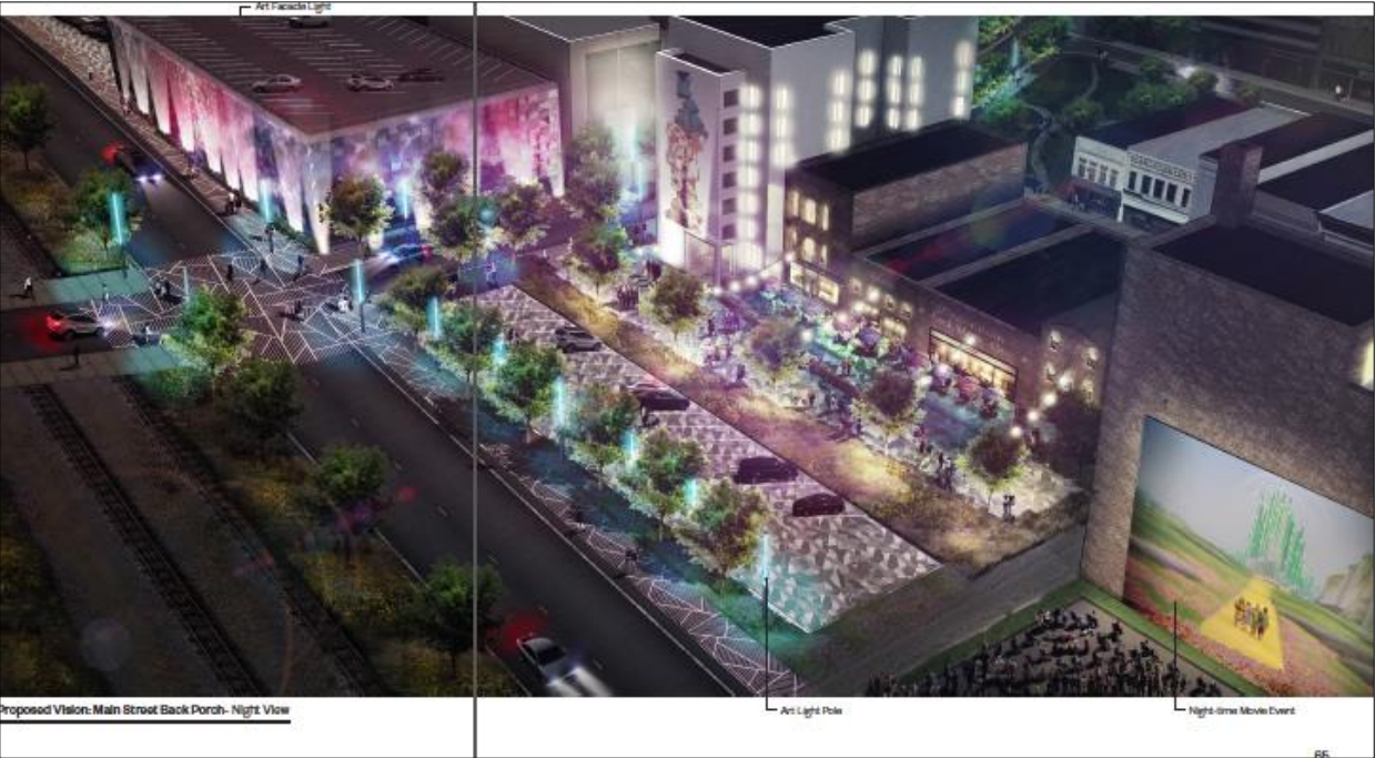
Downtown Durham Vision Plan Day and Nighttime Views of Parking Garage with Art Wrap and Back Porch Area of Main Street