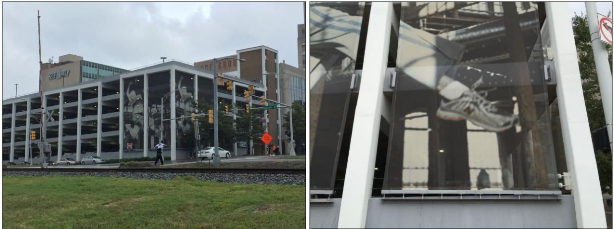
Durham Parking Garage, Current View with Close Up of Banner Installation [2016]